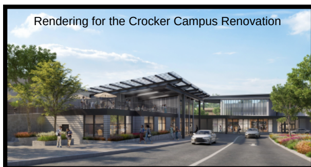
Rendering for the Crocker Campus Renovation

Quattrocchi Kwok Architects (QKA) have submitted their plans to the Division of the State Architect (DSA) for the Crocker Campus Renovation!